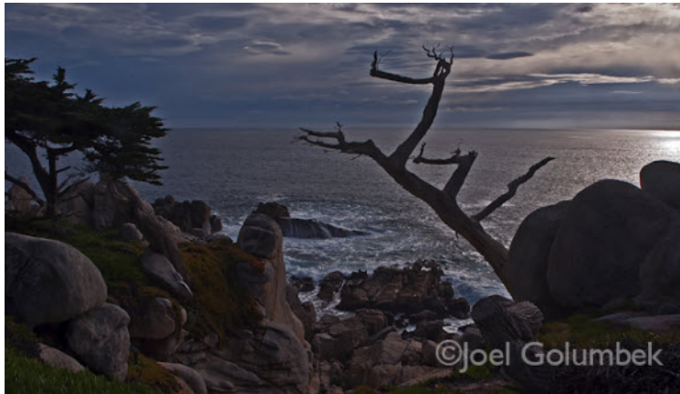
Digital Images "Best of the Month" Joel Golumbeck